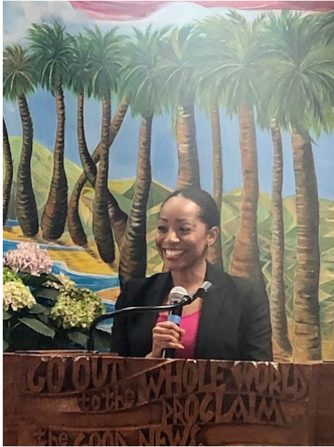
Keynote Speaker Malia Cohen, California State Controller (stood in in absence of Dolores Huerta