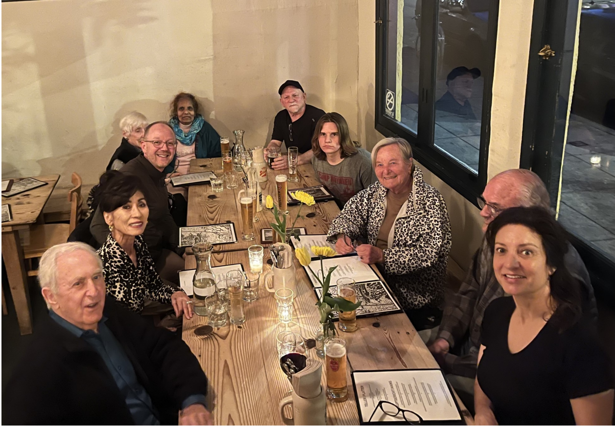
October Feast at Suppenkuche October 26, 2023